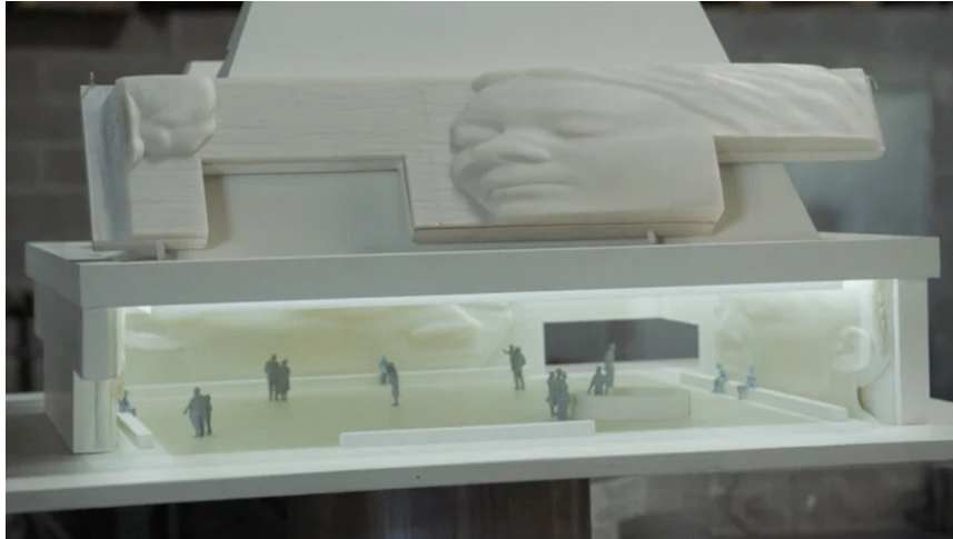
jaume plensa, UTOPIA model for frederik meijer gardens & sculpture park, in grand rapids, michigan

JP: I have always said that my study is located in my head, in the nomadic displacement, and in the multiple activities between materials and ideas.