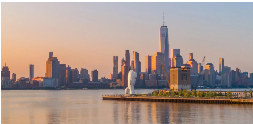
jaume plensa, 'water's soul' rendering, 2020, newport development, jersey city, new jersey

JP: the exhibition NEST explores the head as a poetical shelter that embraces and protects our inner world. for me, the head is the nest where our dreams are born.