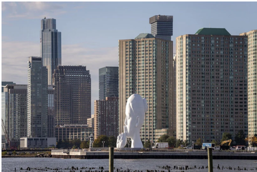
jaume plensa, water's soul, 2020, courtesy gray chicago/new york artwork © jaume plensa studio | photo by timothy schenck

designboom spoke with jaume plensa to find out more about his recently-unveiled projects, as well as his current interests and themes that drive his work. read our interview in full below.