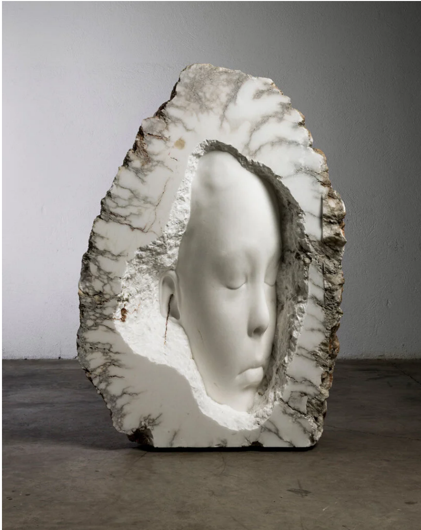
jaume plensa, LUCIA (nest), 2021 | alabaster 571/2×401/8×201/2in(146x102x52cm) 874 kg © jaume plensa | courtesy of galerie lelong & co.

DB: how do you intend your work to engage with the cities in which they reside? what impressions do you hope it conjures? what dialogue do you hope it provokes?