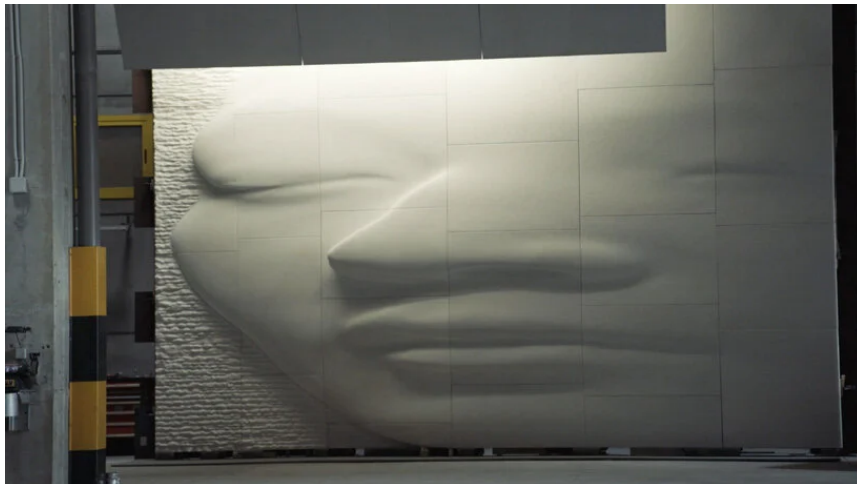
jaume plensa, UTOPIA

JP: I believe that the most important things in life are always invisible; connections that embrace our body in its mysterious relationship with nature and community.