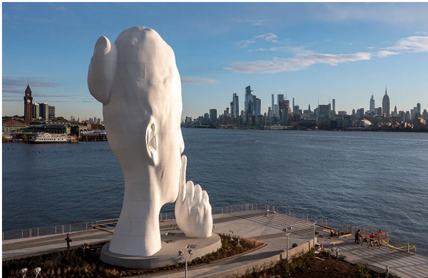
jaume plensa, water's soul, 2020, courtesy gray chicago/new york artwork © jaume plensa studio

DB: can you tell us more about UTOPIA , your largest indoor project to date, set to open soon as part of the new welcome center for the frederik meijer gardens & sculpture park in grand rapids, michigan?